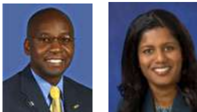
Minister of Family, Youth and Sports Stephen Lashley (left) and Minister Dr Esther Byer Suckoo.

The Commonwealth Secretariat would like to thank Barbados Minister Dr Esther Byer Suckoo for her work and commitment to 9WAMM and wish her well for her new portfolio as Minister of Labour.