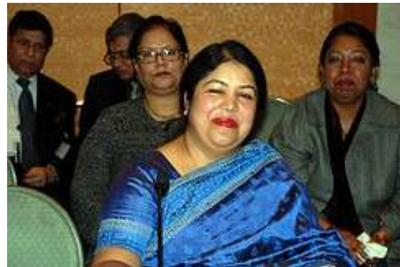
Dr Shirin Sharmin Chaudhury, State Minister for Women and Children's Affairs, Bangladesh - and Chair of the Commonwealth Gender Plan of Action Monitoring Group

For further enquiries about the work of the Commonwealth Secretariat's Gender Division, please click here .