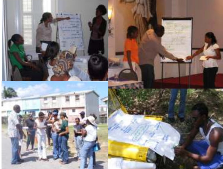
Photos showing participants engaged in classroom and field work sessions using the Participatory Research techniques.