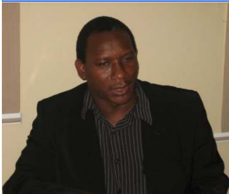
The Hon. Lenard Montoute, Minister responsible for Youth Affairs in St Lucia.

The Government of Saint Lucia is set to receive assistance from the Commonwealth Youth Programme Caribbean Centre (CYPCC) in developing a 'Youth and Crime Initiative', following a request by newly appointed Minister of Home Affairs and National Security, Senator the Honourable Guy Mayers.