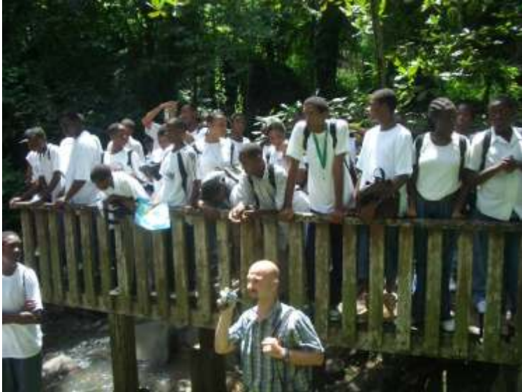
A group of students at a heritage site during the Youth Heritage Tour on September 30.

The Department of Youth Affairs of St Vincent and the Grenadines in collaboration with the Regional Youth Caucus representative Ms Shenica Haynes conducted a successful Youth Heritage Tour of several local communities in observance of Caribbean Youth Day on September 30.