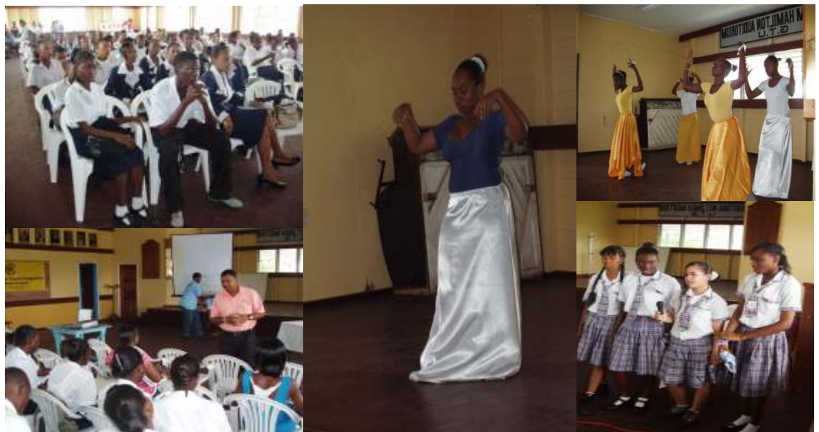
Photo Highlights of Caribbean Youth Day celebration in Guyana

After the films participants were divided into groups to discuss ways in which they could promote peace in their schools, homes and communities.