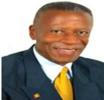
The Honourable Tillman Thomas, Prime Minister of Grenada