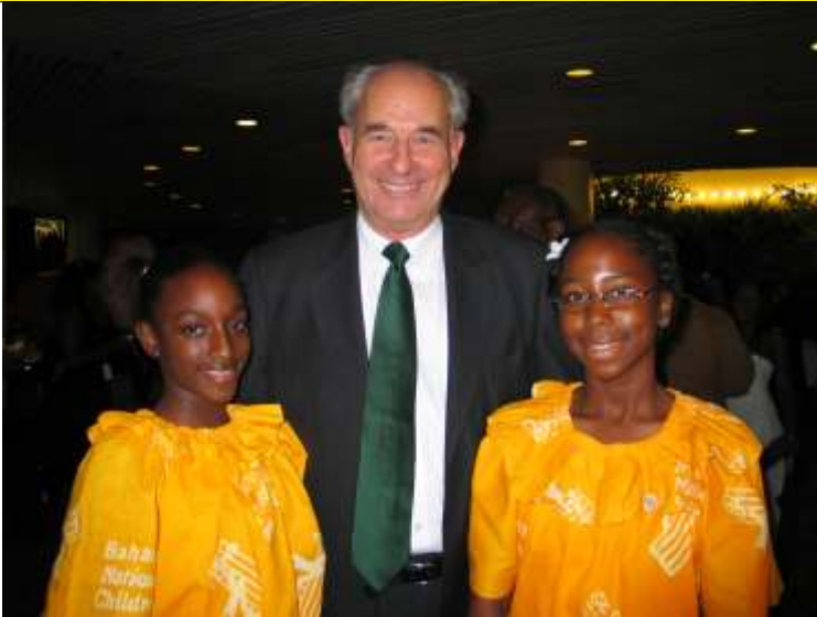
Commonwealth Secretary-General Rt Hon. Don McKinnon with two young Bahamians at the opening ceremony of CYMM 2006 in The Bahamas.

Commonwealth Secretary-General Don McKinnon has urged member countries to do more "to secure not just the future of young people, but the present". It was important, he said, to enable young Commonwealth citizens to "grow up to see their own visions become reality".