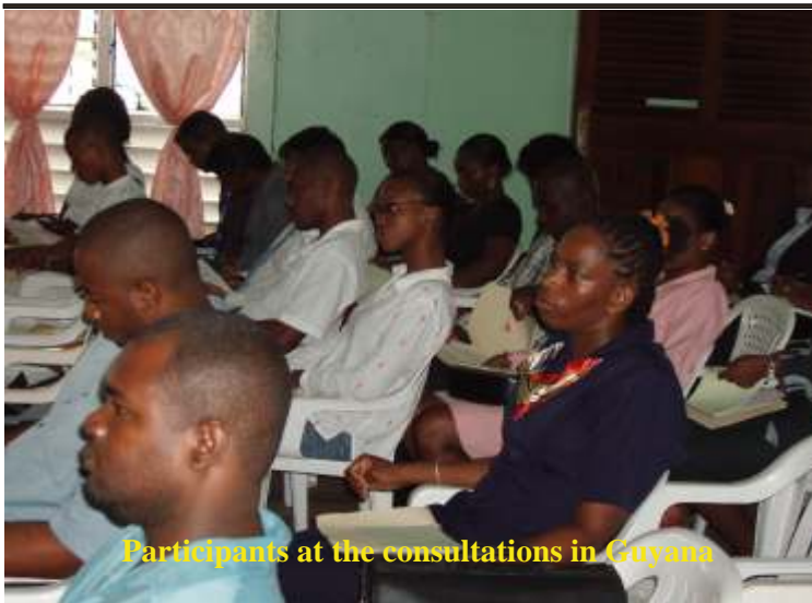
Participants at the consultations in Guyana

Over the years many graduates of both programmes, but more so the Diploma programme, have been expressing the concern that their youth work qualifications are not recognized by their respective Public Service Commissions and as such did not have much marketability. As a consequence many cannot gain employment, receive promotion or adequate remuneration. CYPCC's