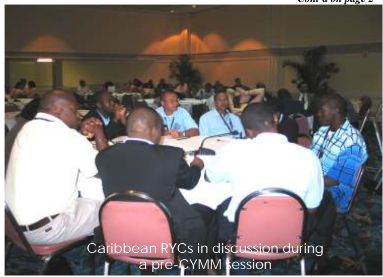
Caribbean RYCs in discussion during a pre-CYMM session