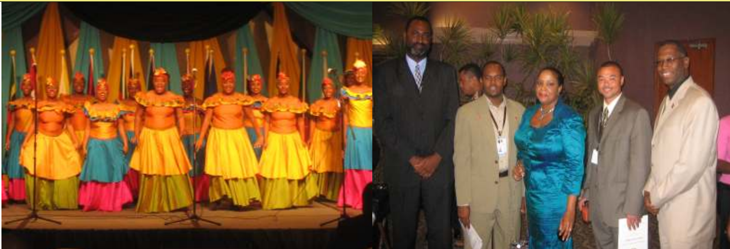
Photo highlights of CYMM 2006