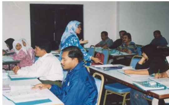
A class at UPM.

As this is an international program, it was recently awarded full recognition by t