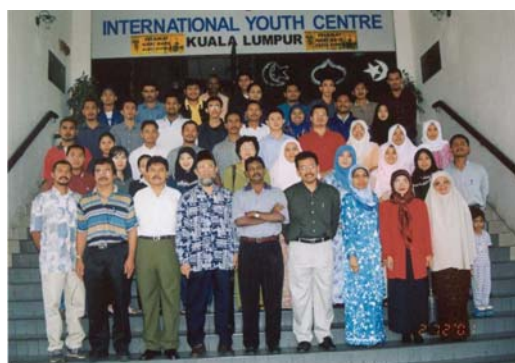
The full student body

the government. This provides the impetus for more youth leaders to participate in this program. As a matter of fact, we have already selected and enrolled a new batch of students for the first semester.