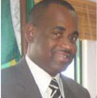
The Hon. Roosevelt Skerrit, Prime Minister of Dominica

The Government of Dominica has given a major boost to youth enterprise development on the island with an announcement, by the Honourable Prime Minister Mr. Roosevelt Skerrit, that EC$2 million will be made available to the Dominica Youth Business Trust (DYBT) during the 2006/2007 fiscal year.