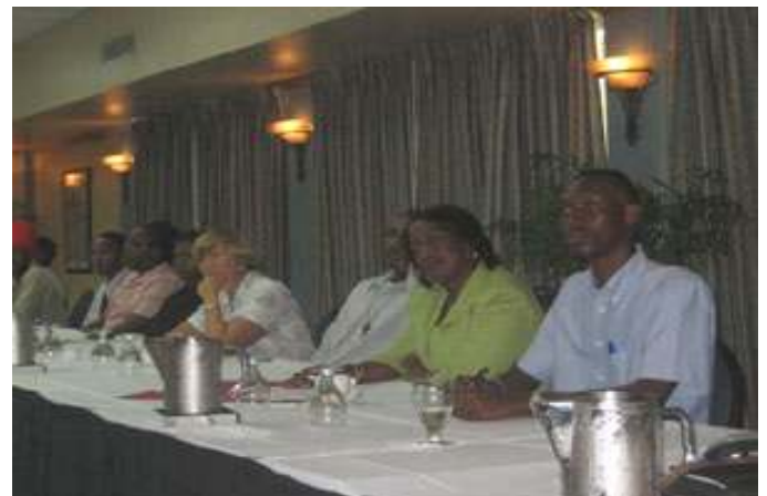
Participants at the Strategy Implementation Workshop for Antigua and Barbuda's National Youth Policy.

She reiterated: "It was a highly intensive but fun session...there was overall acceptance and agreement