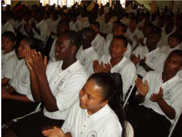
A cross-section of graduates

The graduates were trained in eight disciplines including Business Studies, Carpentry, Electrical Installation, Joinery, Masonry, Motor Mechanics, Plumbing and Sheet Metal, Welding and Fabrication. Guyana's President, the Honourable Mr. Bharrat Jagdeo, in his address pledged his government's support for youth development noting that the government wants to create a culture of skills development amongst young Guyanese in order to make them