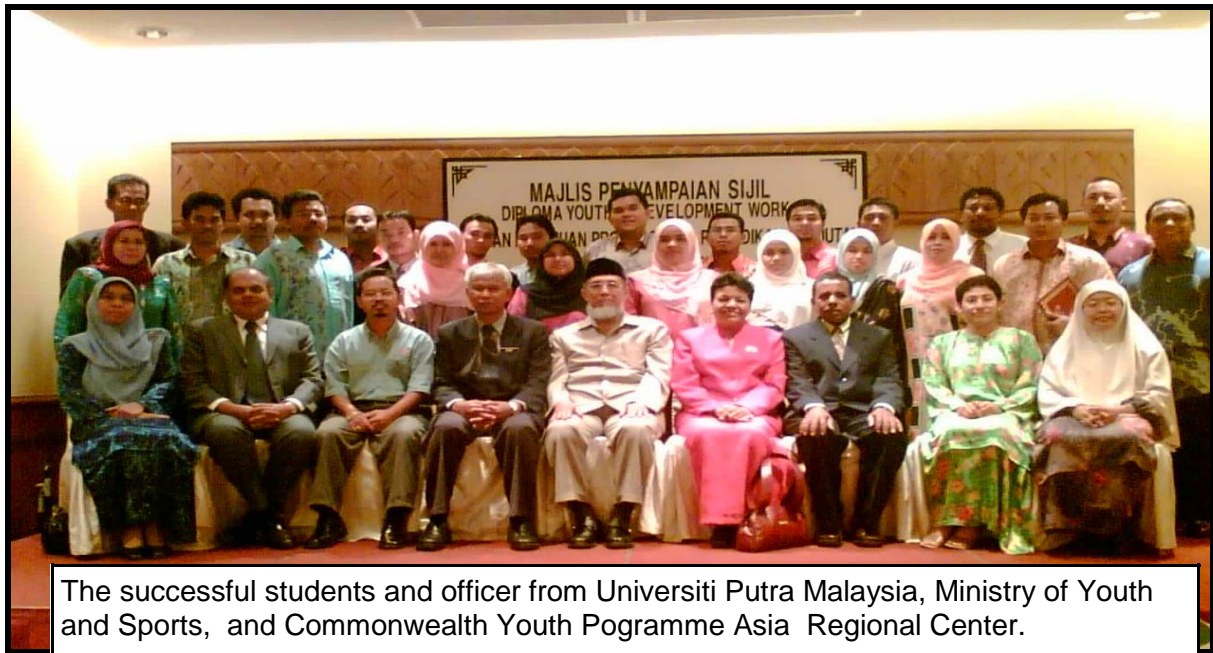
The successful students and officer from Universiti Putra Malaysia, Ministry of Youth and Sports, and Commonwealth Youth Programme Asia Regional Center.