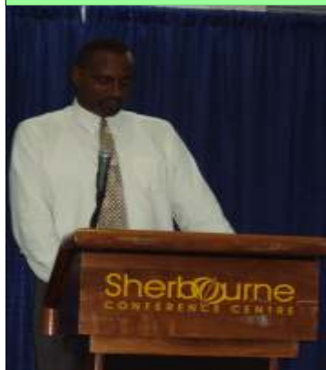
The Hon. Mr. Anthony Wood, Minister of Education, Youth Affairs and Sports

The Honourable Mr. Anthony Wood, Barbados' Minister of Education, Youth Affairs and Sports has welcomed the new Regional Lecture Series on youth development issues which was officially launched on September 30 at the Sherbourne Conference Centre in Barbados.