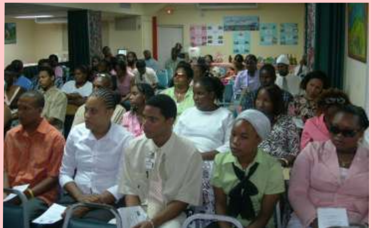
A section of the graduates at the DYBT graduation ceremony

The DYBT was introduced to Dominica in 2004 and is based on the