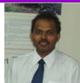
The Hon. Dr. Frank Anthony

The Honourable Dr Frank Anthony is Guyana's new Minister of Culture, Youth and Sports following Guyana's National and Regional Elections on August 28, 2006. He is also a former Commonwealth Youth Programme Caribbean Youth Exchange delegate.