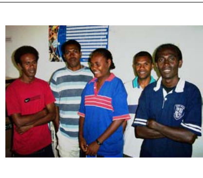
Members of the SICHE student committee

completed this program last year 2003 is working hard to set up a nationally recognized Youth Develop-